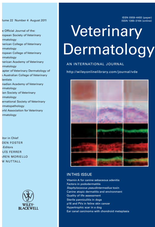
August 2011 issue of Veterinary Dermatology