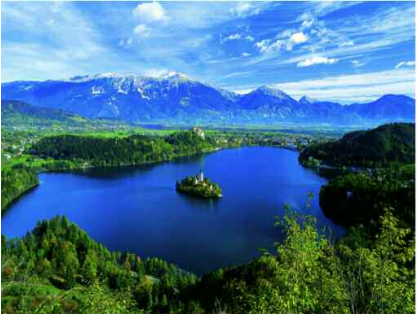
Beautiful Lake Bled in Slovenia, former holiday home of both the Slovenian royal family and Marshal Tito, President of Yugoslavia, and location of the 2009 Annual ESVD-ECVD Congress. The congress hotel is located at the far end of the lake

Veterinary dermatology is growing in eastern European countries and a European society like the ESVD should take this into consideration. It is important that the national veterinary dermatology groups- whether they are well-established or just starting out- are supported by the Society. The choice of organizing an annual congress in eastern countries such as Slovenia in 2009 and Poland in 2014 goes in this direction.