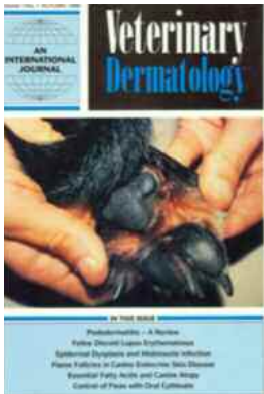
First issue of Veterinary Dermatology

The journal is now produced by Wiley-Blackwell, based in Oxford. For 2010 the journal was ranked 23/145 journals in veterinary science with an impact factor of 1.647. Veterinary Dermatology is now well established as a prestigious world veterinary journal that is eagerly awaited every two months by its readers including the members of the seven societies that have it as their official journal.