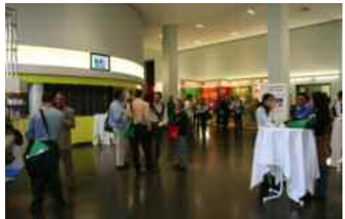
Part of the commercial exhibition held in Mainz – Germany 2007

Although ESVD has always been a 'not-for-profit' organisation, some years ago the decision to convert the society into a charity was taken. This change involved some quite complex financial and legal processes and was very difficult and time-consuming for the ESVD Board. However, in 2010 ESVD became a Charity registered in the UK. The future of the ESVD is secure. We have substantial financial reserves to enable us to continue to serve our members and advance the science of veterinary dermatology for the benefit of our patients and their owners.